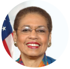
Eleanor Holmes Norton