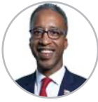
Kenyan McDuffie Councilmember Council of the District of Columbia

His an experienced attorney, civil rights advocate, and community leader dedicated to improving the lives of District residents, Kenyan R. McDuffie, was first elected in a 2012 special election to represent Ward 5 on the Council of the District of Columbia. In November 2014, Ward 5 voters overwhelmingly re-elected him to serve a full four-year term. Councilmember McDuffie was again re-elected in 2018. In 2022, District residents, in all 8 Wards, elected him to serve as Councilmember At-Large.